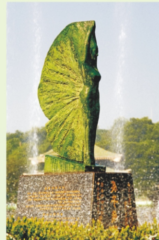
Bronze Statue of Flying Tazuko

Chengcing Lake became "sister lakes" with Lake Tazawa-ko of Japan in 1987. To commemorate the alliance, the bronze statue of Flying Tazuko was presented by Japan and erected by the lake in the form of water fountain landscaping.